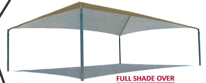
FULL SHADE OVER PLAY EQUIPMENT