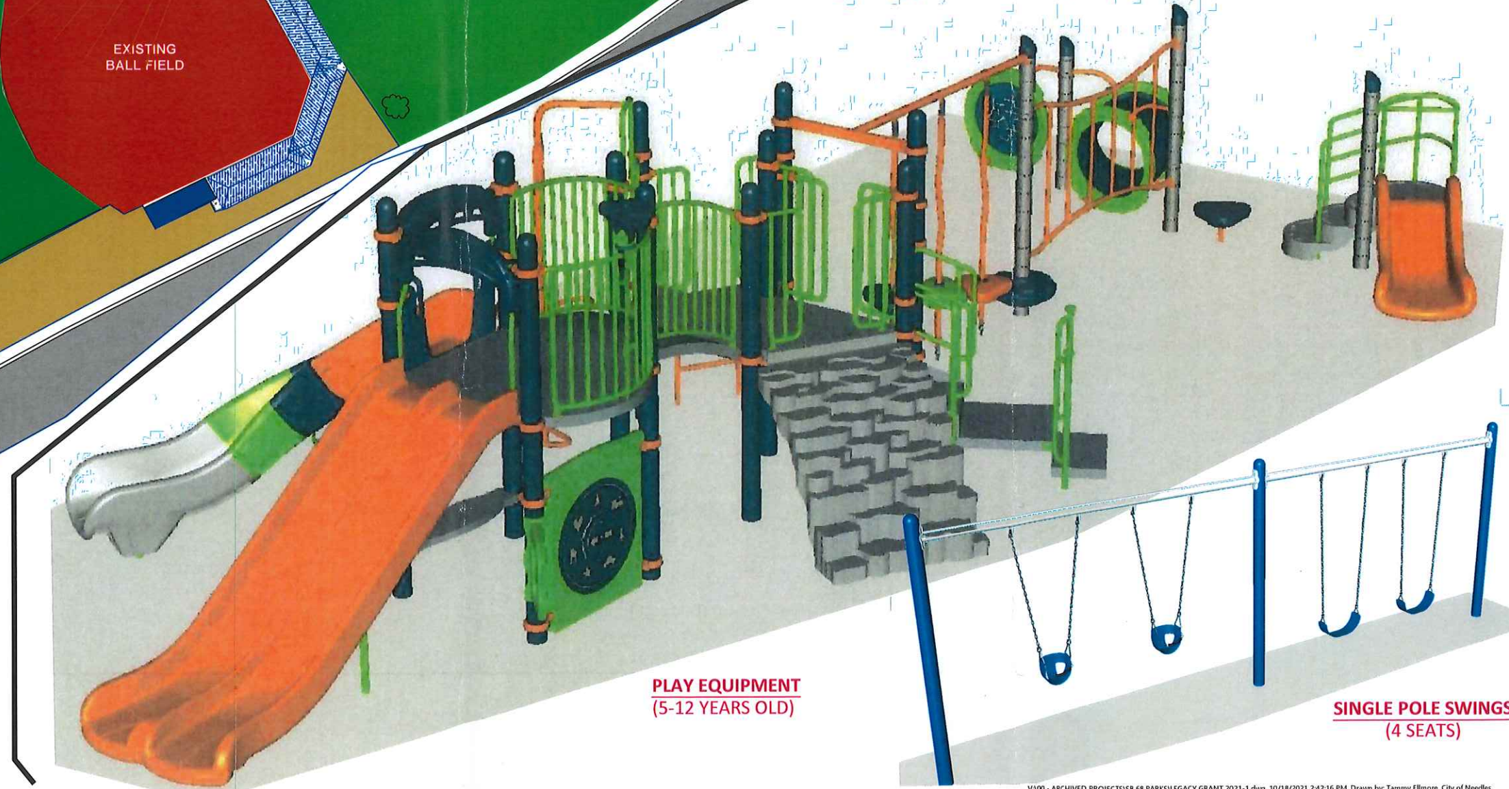
PLAY EQUIPMENT (5-12 YEARS OLD)