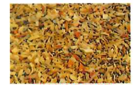
ENGINEERED WOOD CHIPS UNDER PLAY EQUIPMENT