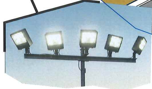
FIELD LIGHTING (6 LOCATIONS)